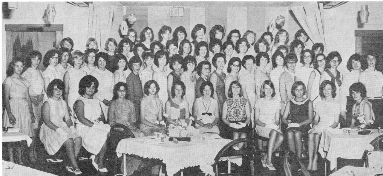
SENIOR GIRLS GUESTS of Tri Kappas. "An afternoon of Charm in the Orient" was the theme of the Tri Kappa party given for the senior girls of Corydon Central High School last Wednesday. The girls met in VFW Hall which was decorated in the fashion of the Orient.